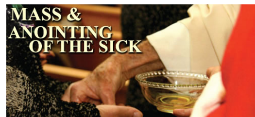
MASS & ANOINTING OF THE SICK FEBRUARY 8, 2018 at 6:30 pm

Tuesday – Friday 5:15pm – 6:00pm Saturdays in the Chapel 3:00pm – 3:45pm